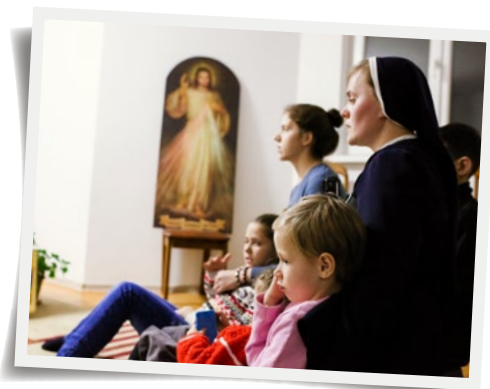
The Sisters of the Immaculate Conception in Kazakhstan run a home for abandoned children. The Sisters care for their every need; they feed them, educate them and teach them to love Jesus.

The decision to leave a gift in your Will is a very personal one. There is no obligation to let ACN know that you plan to leave a legacy, or how much that legacy will be, and a person is always free to change their Will at any time. However, if you do plan to leave a legacy to ACN, we would love to hear from you. This allows us the opportunity to thank you, to stay connected with you and to also broadly be aware of the amount of assistance we may be able to offer the suffering Church into the future. You are invited to complete the pledge form in this booklet, online at our website, or to call us at any time. Please be assured any conversation or pledge is kept completely confidential.